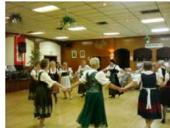
Judging the dirndls